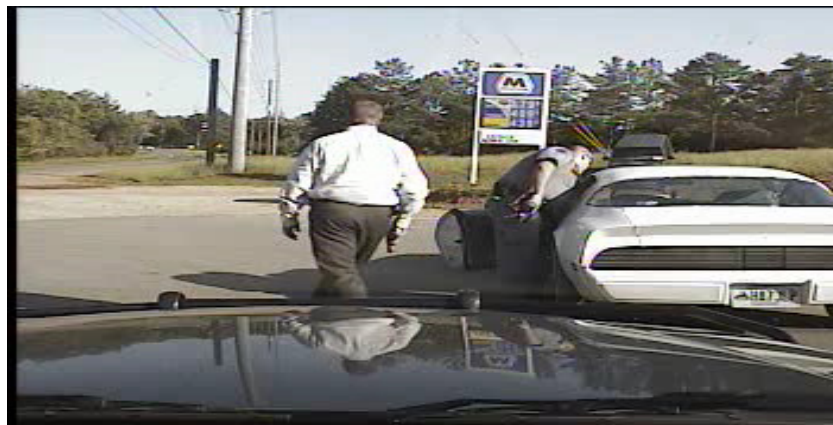
Exhibit "G" (Brown Dashcam) at 18:11:57.